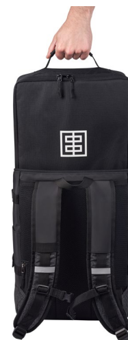
Elinchrom ONE Backpack 33252