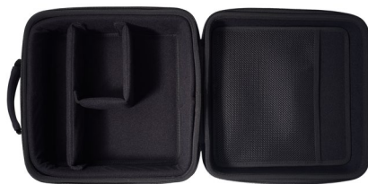
Elinchrom ONE Case 33250