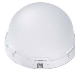
Elinchrom OCF Diffusion Dome 25110