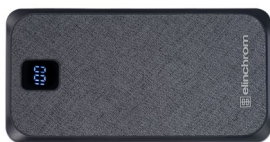
Elinchrom 20000mAh 18W Power Bank 11050